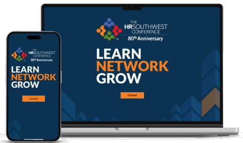
Template B With a background