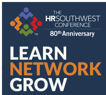
Template A and B Logo Image 1000 pixels wide JPG or PNG format